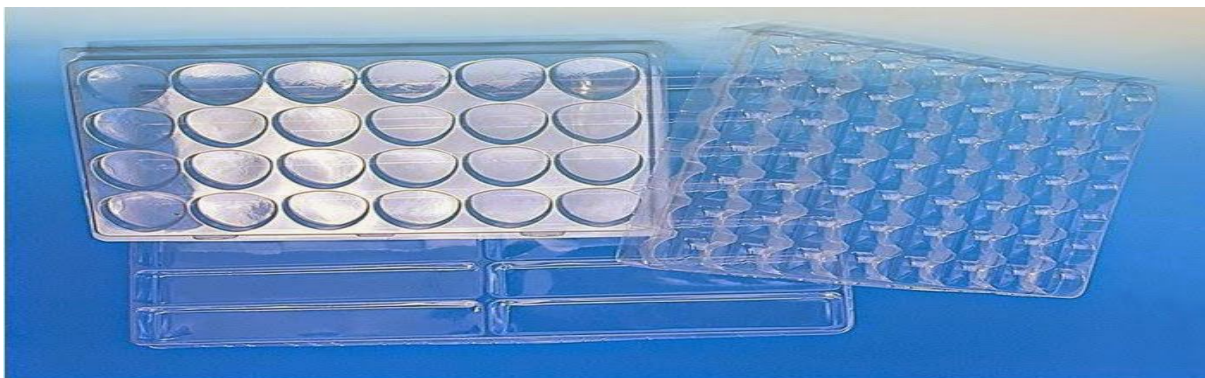
Fig.2. PVC Blister Cavities

Polyvinyl Chloride (PVC): Polyvinyl chloride has good crystal-clear surface and provides good protection from chemical hazards. Polyvinyl chloride has low thermal stability low physical endurance as compared to PET films after but due to its low cost and good barrier properties it is the most widely used material in blister packaging applications of pharmaceutical.