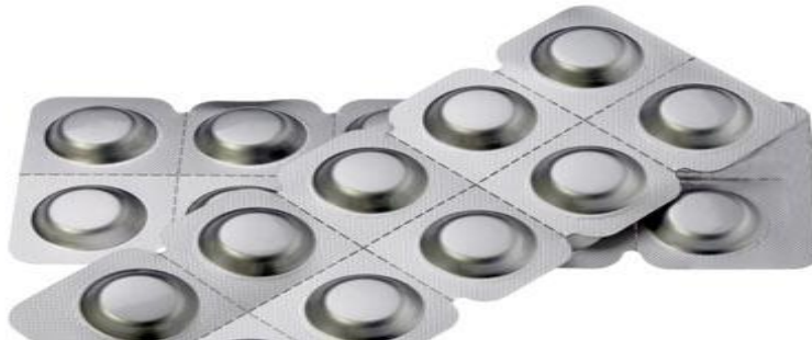
Fig.4. Aluminum Cavities

Aluminum: Aluminum foil is used in such application where more water and oxygen obstruction and long life is required for the product. It is used into cold forming process of blister packaging because of its different points of interest into 3-layers overlay: PVC/Aluminum/Polyamide. The PVC side is within in contact with the product. Aluminum foil has more cost as compared to polymer films.